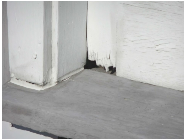
Rotted panel within clock tower section