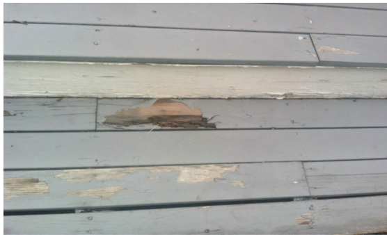
Portico front steps